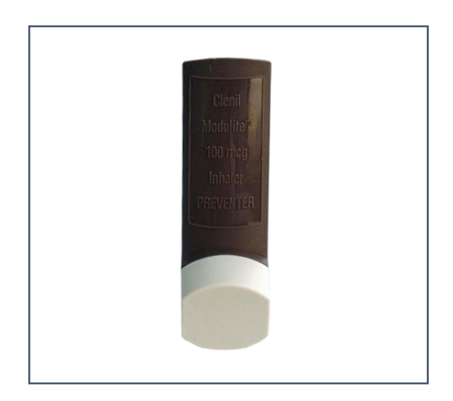
Clenil 100mcg inhaler from a regular batch